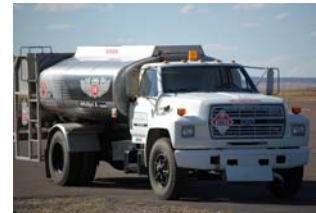
One of the Fuel Trucks on the line at High Mountain Aviation...